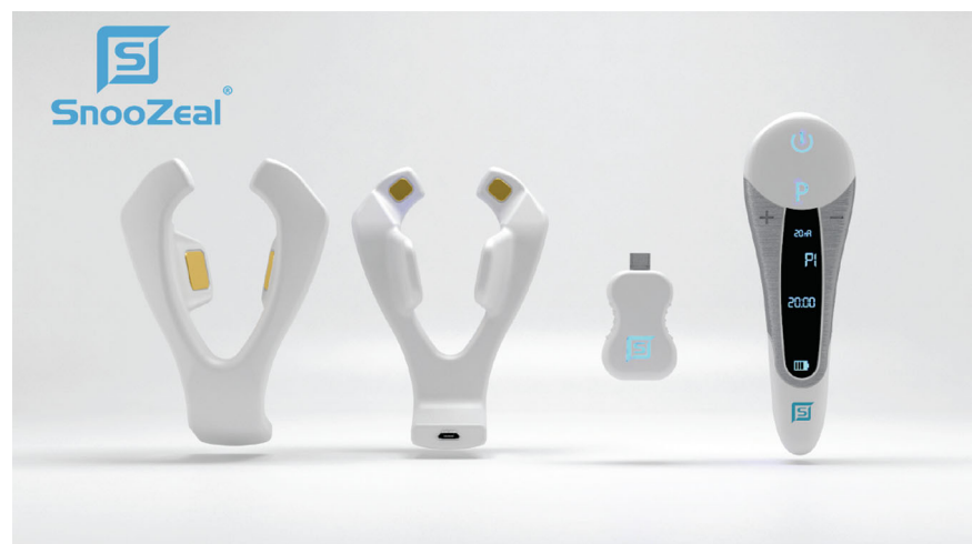
Fig. 1 ▲ Illustration of the SnooZeal© device (Snoozeal Limited, London, GB). Two images on the left show the intraoral device element from the front and back, two images on the right show the control unit and remote control respectively. Reproduced with permission of the manufacturer

Nonetheless, subjects who snore present with relevant complaints. It is typical that the quality of life of the bedpartner, specifically, is reduced. Women with partners who snore often complain about sleep disorders, headaches in the morning, and fatigue during the day [15]. According to a study published in 2005, 55% of bedpartners of patients with sleep-related breathing disorders are disturbed almost every night, 40% sleep in another room at least once a week, 26% regularly use earplugs or sleeping pills, and 35% report at least intermittent relationship problems occurring due to the snoring [17].